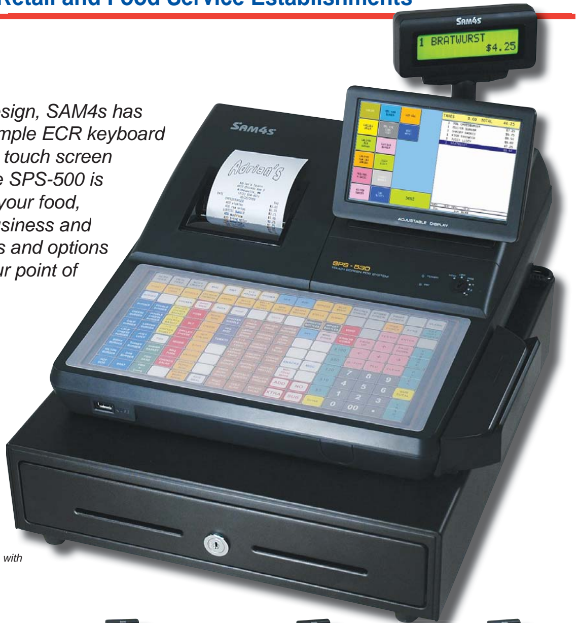
SPS-500 Series Hybrid ECRs Shown with Optional Card Reader

Featuring a hybrid design, SAM4S has combined fast and simple ECR keyboard entry with an intuitive touch screen operator display. The SPS-500 is easily configured for your food, beverage, or retail business and provides the functions and options you need to meet your point of service needs.