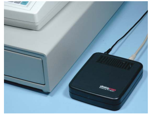
DataTran™ Integrated Electronic Payment Option