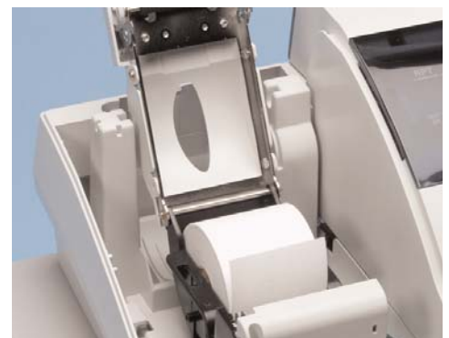
Quick and Easy Drop-In Paper Loading