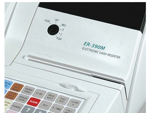
Internal Magnetic Card Reader Option