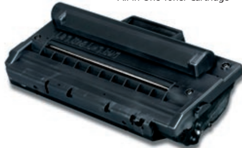
All-in-One Toner Cartridge