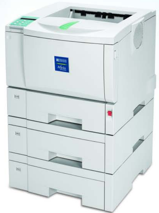
Fully configured Ricoh Aficio AP410N

The compact RICOH® Aficio® AP410/AP410N Series – available in two configurations – offers everything needed to achieve the highest levels of office productivity and efficiency: low cost per page, fast throughput, a large expandable paper supply, flexible paper handling, superb image quality, and intuitive device management utilities. The Aficio AP410 is ideal for budget-conscious business professionals, while the equally affordable network-ready Aficio AP410N serves as a robust, shared network printing resource. The Aficio AP410 and AP410N are true “Best-in-Class” printers from an industry leader – Ricoh.