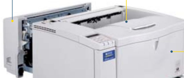
Standard 250-sheet Output Tray