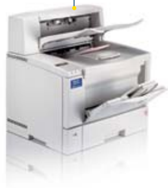
Optional 1-bin Shift Sort Tray