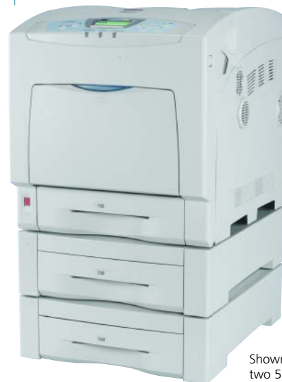
Shown here with two 550 sheet optional trays

Specifications subject to change without notice