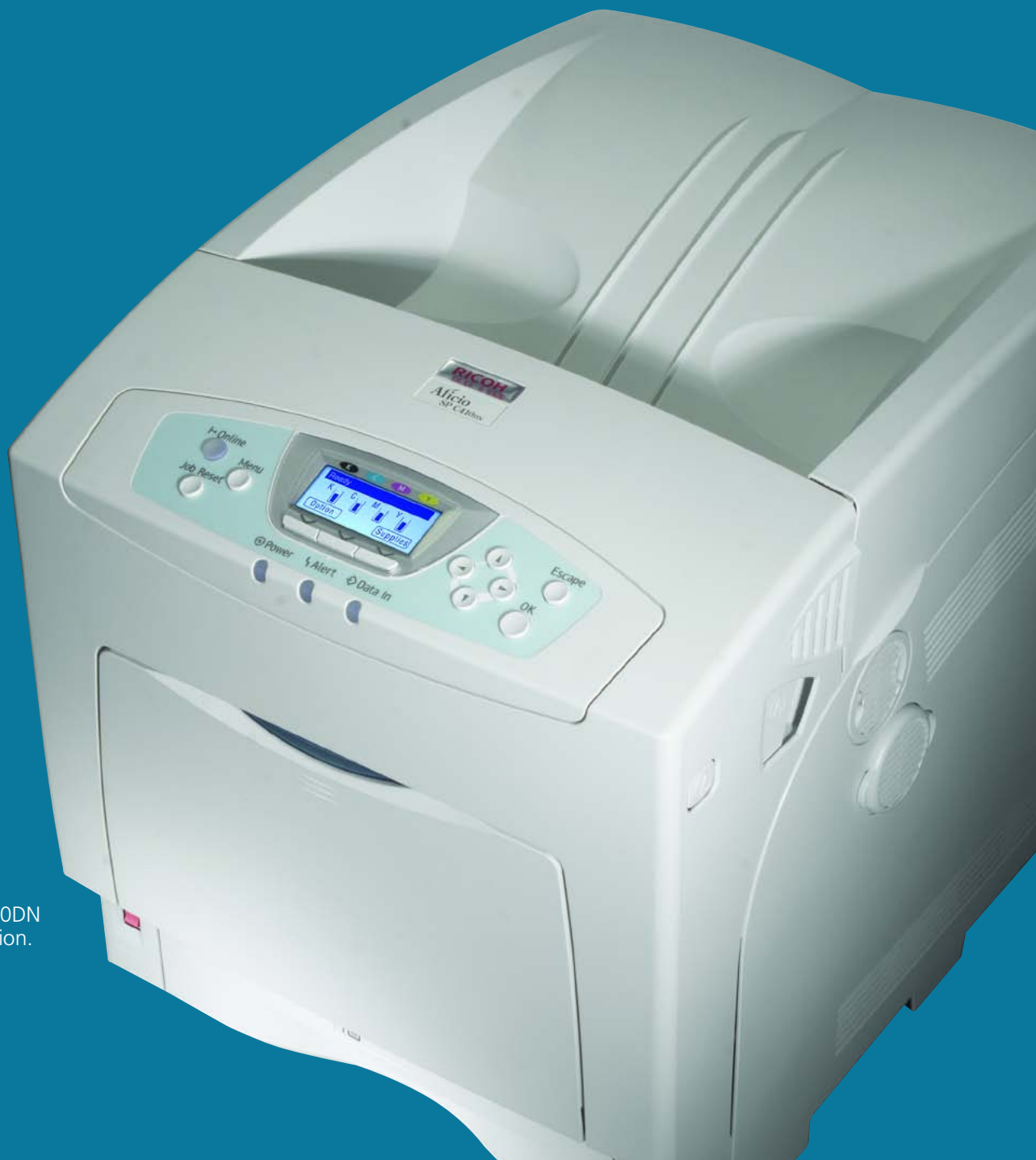
Ricoh Aficio SP C410DN standard configuration.

Making the move from black & white to color is easier than you think with the RICOH® Aficio® SP C410DN/SP C411DN Color Laser Printers. That's because they combine captivating color and affordability into systems that impress with fast print speeds, high reliability, standard two-sided automatic printing and high-yield consumables.