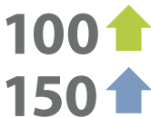
Employee Capacity Expansion