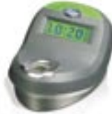
TS100 Fingerprint Reader