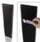
Badge Storage Racks