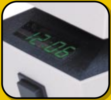
Optional Digital Display

The LT Series Stamps help you keep track of incoming mail, legal documents, freight bills and customer pick-ups, invoices and payments, or any other sensitive document. Without a doubt, a Lathem LT is the fastest, easiest, and most efficient way to keep up with all the "ins and outs" of your business.